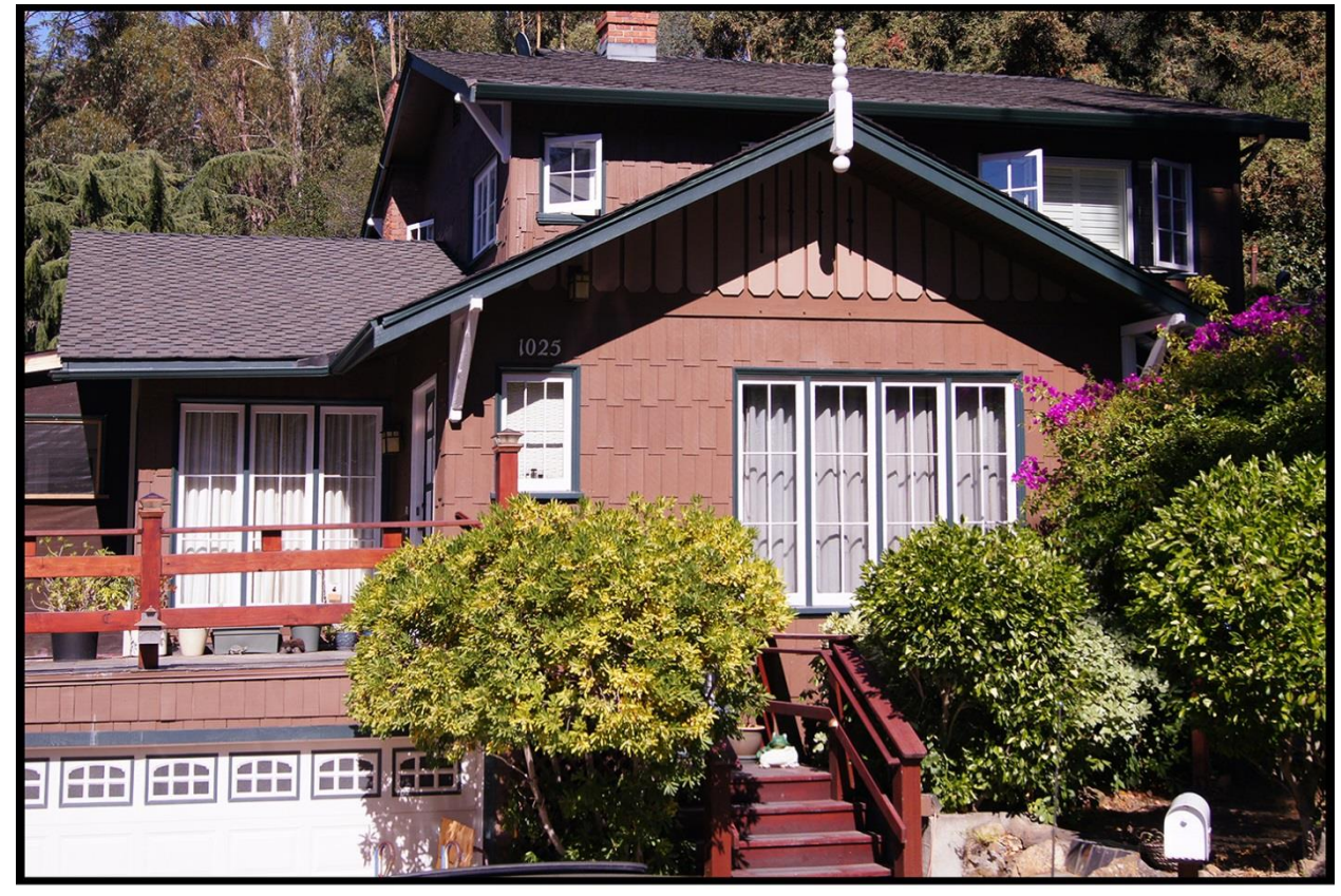
Harry Potter fans will enjoy visiting this house. It has a secret door to a hidden sleeping nook, but one that is much cheerier than the "closet under the stairs" in which the young wizard slept.